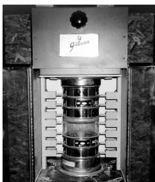
See page 2 for the story on how GLITeC and NASA strengthened ADMA, Inc.'s operations through new technology.